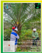
Application of Polimesh at Various Stages of Plant Growth