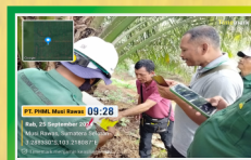
Counting E. Camerunicus 30-60 Minutes After Polimesh Application