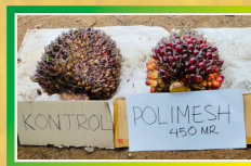
CALCULATION OF FRUIT SETS FOR COMMERCIAL DEMONSTRATIONS