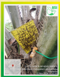
Using Sticky Traps to Count the Weevils Trapped